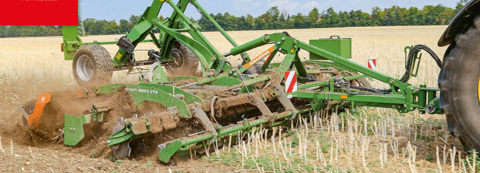
Amazone Catros XL 6003-2TS compact disc harrows:

The Catros XL has been designed for shallow to medium depth cultivation. A leading knife roller is now on the options list.