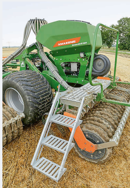
The GreenDrill 501 has a 500-litre hopper, with a sturdy operator platform easing refills.

The distribution head is segmented and can have anything from 12 to 48 outlets, and, unusually for this type of drill, a tramline feature is standard.