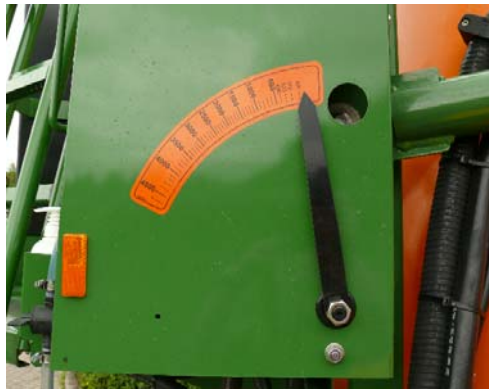
Fig.6: Contents indicator for filling.

liquid system. The separate hand wash tank holds 22.5 l. The pressurised agitation system can be switched off to keep the