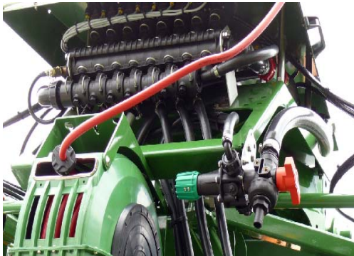
Fig.7: Block with section valves and pressure adjustment device of the recirculation system „DUS“ (big tube at the right side).

the spray. Also the fluid conducting parts of the boom can be rinsed independently. The circulation system works with a fixed liquid pressure in the pipes but it can also be completely switched off. Thanks to this (overpressure) recirculation system the amount of non delutable residual can be reduced to about 1.5 l. By using the tank filling connection the tank can easily be filled with the pump. The spray level reading is possible manually (at the left sprayer side) or on the display. Both level indicators fulfill the accuracy requirements entirely.